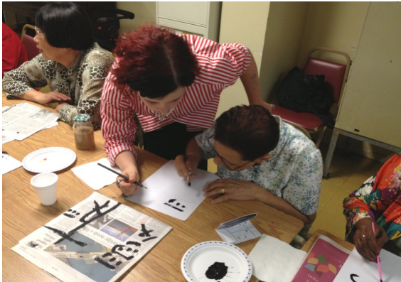
Learning Chinese at Glenyan Manor