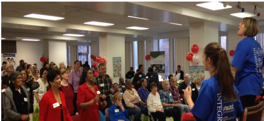
TIGP volunteers led an interactive stretch session and served seniors healthy snacks.