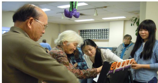
Cultural celebrations at Winchester Square