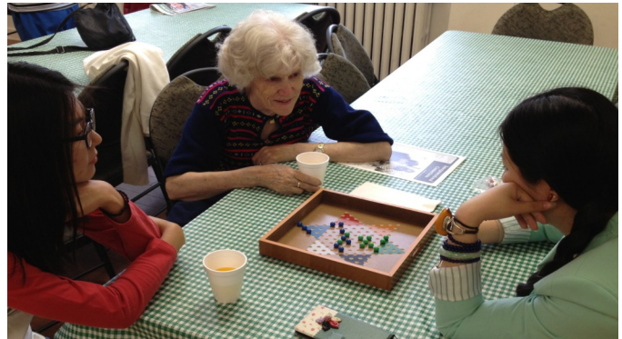
New intergenerational Social Club at Emerald Isle