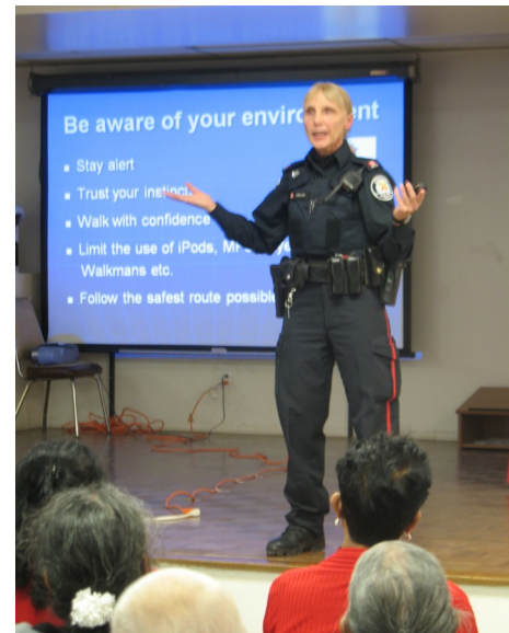
Toronto Police Services educated seniors about community safety.