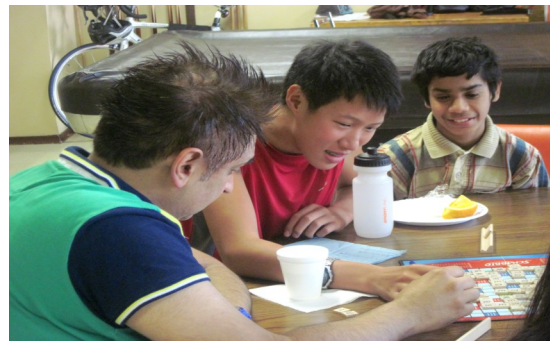
Creating memories at Greenwood Towers