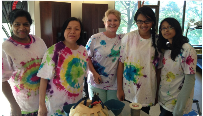
Showcasing artistic talents at East York Acres