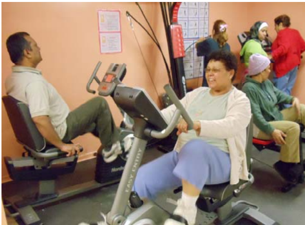
On the move at the Gilder “Community Health and Wellness” program.