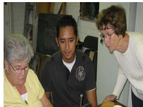
Learning new skills at the Emerald Isle Seniors Society “Seniors in Cyberspace” program.