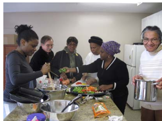
Demonstrating favourite family recipes at the East York Acres “Community Kitchen” program.

Sharing life experiences at the Sunrise Towers “Memory Program”.