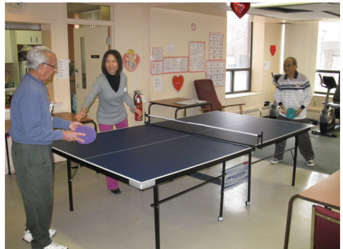
Learning new skills while keeping fit at Gus Harris Place.

Peer volunteers sharing their new knowledge at the Winchester Square “Health and Wellness” program.