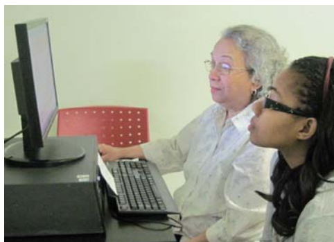
Getting connected at the Greenbrae “Seniors in Cyberspace” program.