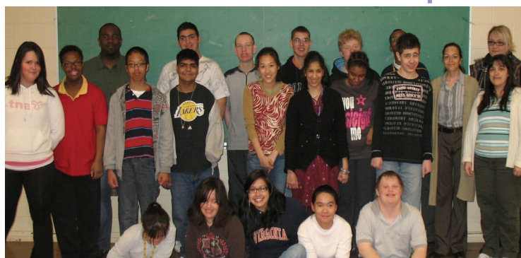
Congratulations to the D.D. Department at Danforth Collegiate and Technical Institute, recipient of the 2009-2010 TIGP Community Partnership Award.

Youth in the D.D. Class at Danforth Collegiate have a long time partnership with Nisbet Lodge where they enjoy friendly visiting and exercising with their senior partners. In addition, the youth assist TIGP with community gardening and eagerly assist wherever needed. Their commitment to caring is invaluable!