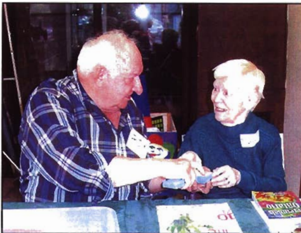
Chester Village residents enjoy sharing their horticultural knowledge with each other.

"Seeing the sparkle in their eyes, hearing the excitement in their voices, and knowing how much they look forward to the program each week is truly a reward in itself."