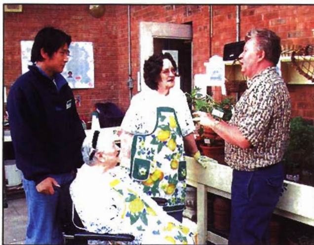
TIGP Volunteers provide residents with tours of the Chester Village Greenhouse.

Staff and volunteers meet regularly to develop program plans that include activities such as leaf painting, discussion groups on plant of the week, greenhouse bingo, and tours of the greenhouse to view the latest additions to the flora.